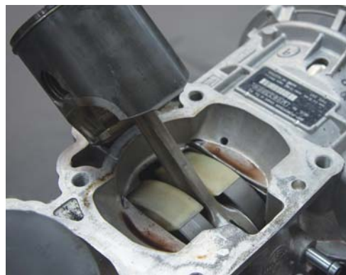
The pistons suffered only minor scuffing.