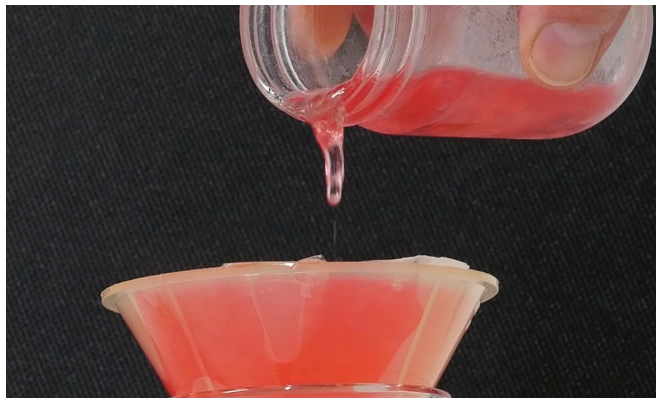
Wax formation in untreated diesel fuel resists pouring.

lowers the cold filter-plugging point (CFPP) by up to 40°F (22°C) in ULSD.