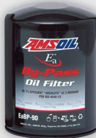
EaBP90 • EaBP100 • EaBP110 • EaBP120

AMSOIL Ea Bypass Oil Filters provide maximum filtration protection against wear and oil contamination. Working in conjunction with the engine's full-flow oil filter, AMSOIL Ea Bypass Filters operate by filtering oil on a "partial-flow" basis. They draw approximately 10 percent of the oil sump's capacity at any one time and trap the extremely small, wear-causing contaminants that full-flow filters can't remove. AMSOIL Ea Bypass Filters typically filter all of the oil in the system several times an hour, so the engine continuously receives analytically clean oil.