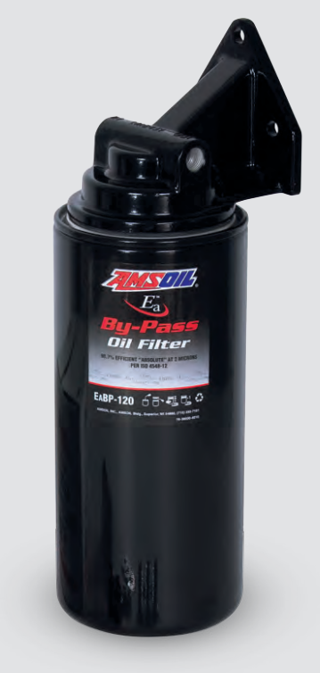
Fittings and hardware not shown

The Heavy-Duty Bypass Filtration System is constructed of high-quality cast aluminum with a steel filter spud that has been thoroughly tested in on-road and severe off-road service. The mount is finished with a thick layer of powder-coated paint to provide maximum resistance to the degrading effects of road salt, debris and engine-compartment chemicals.