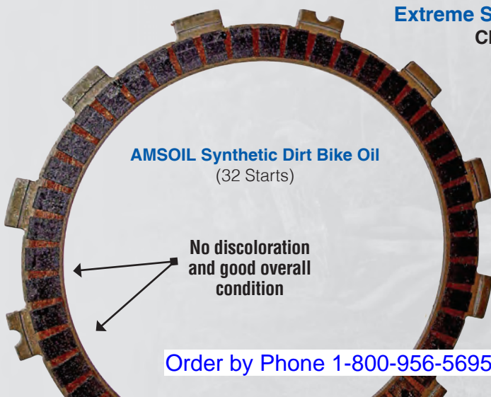
AMSOIL Synthetic Dirt Bike Oil (32 Starts)

No discoloration and good overall condition