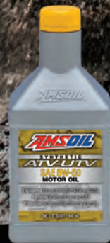
SYNTHETIC MOTOR OIL