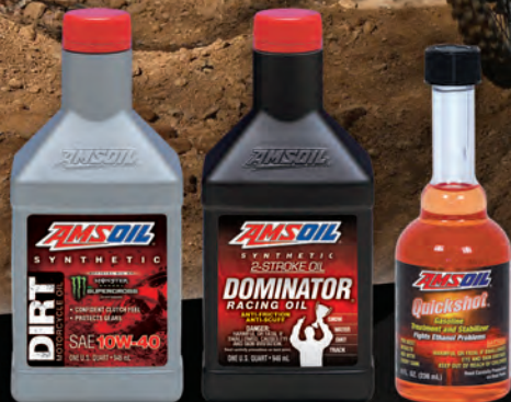
SYNTHETIC 4-STROKE OIL