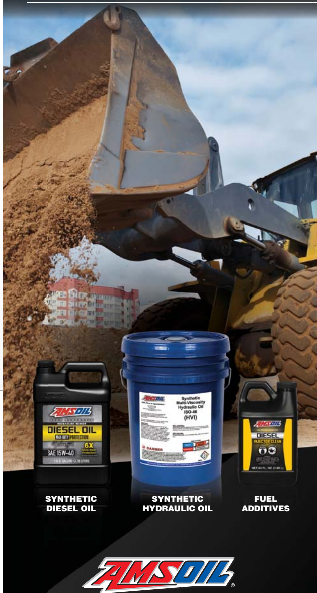
SYNTHETIC DIESEL OIL