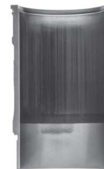
Severely Scuffed Liner