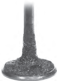
Intake Valve before P.i. Treatment