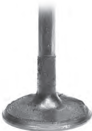
Intake Valve after P.i. Treatment