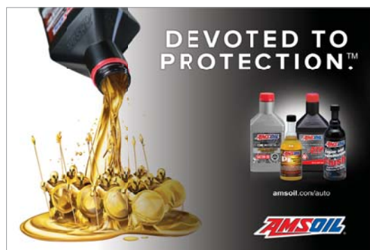
Retail Counter Mat (G3351)