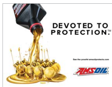
Window Decal 9"x12" (G3356)