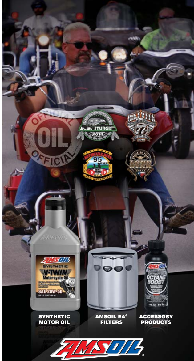
SYNTHETIC MOTOR OIL